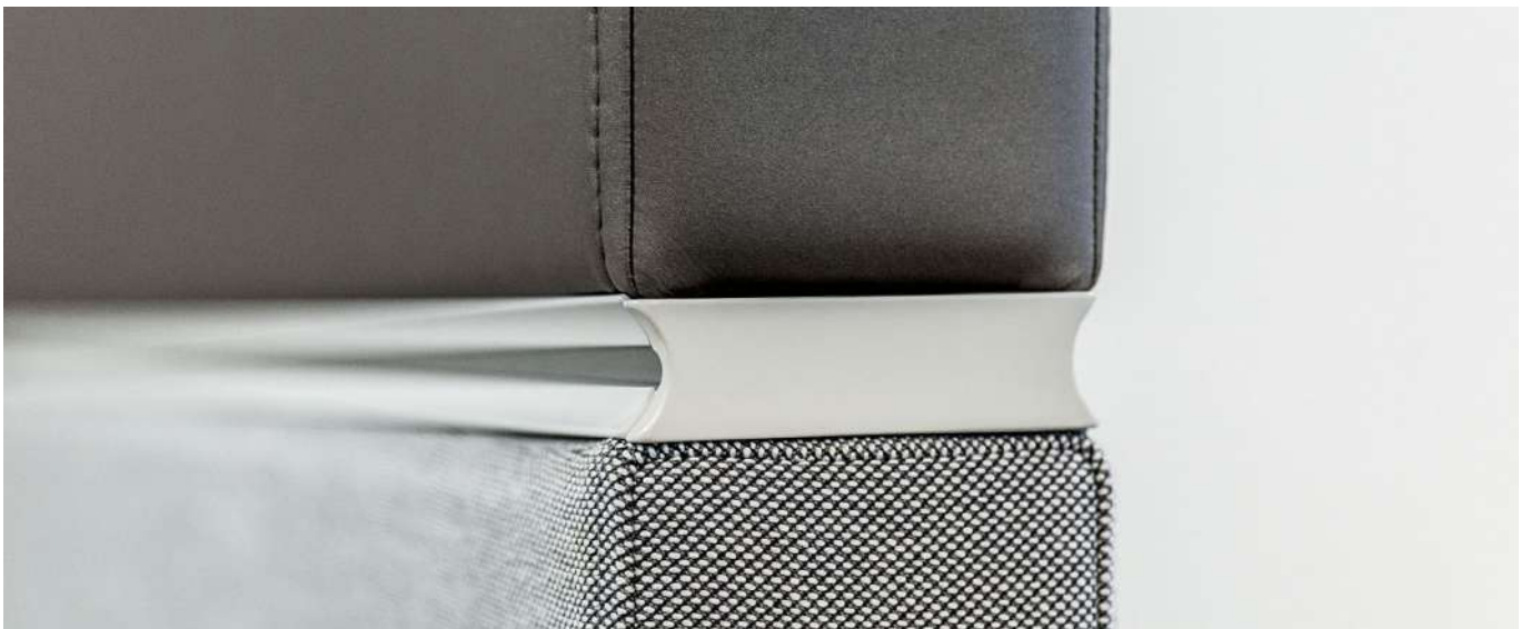
Natura or white workrails