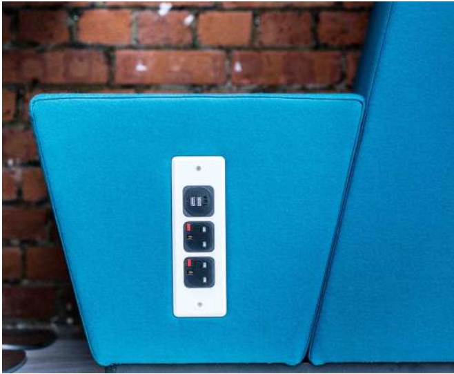
Integrated power options