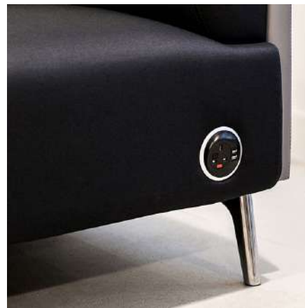
Black or polished aluminium legs