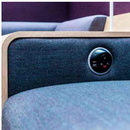
Integrated power options