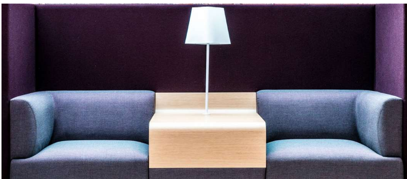
Oak or white console finishes Integral lamp