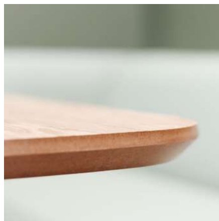
Chamfered edge tables