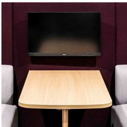
Integrated work surfaces