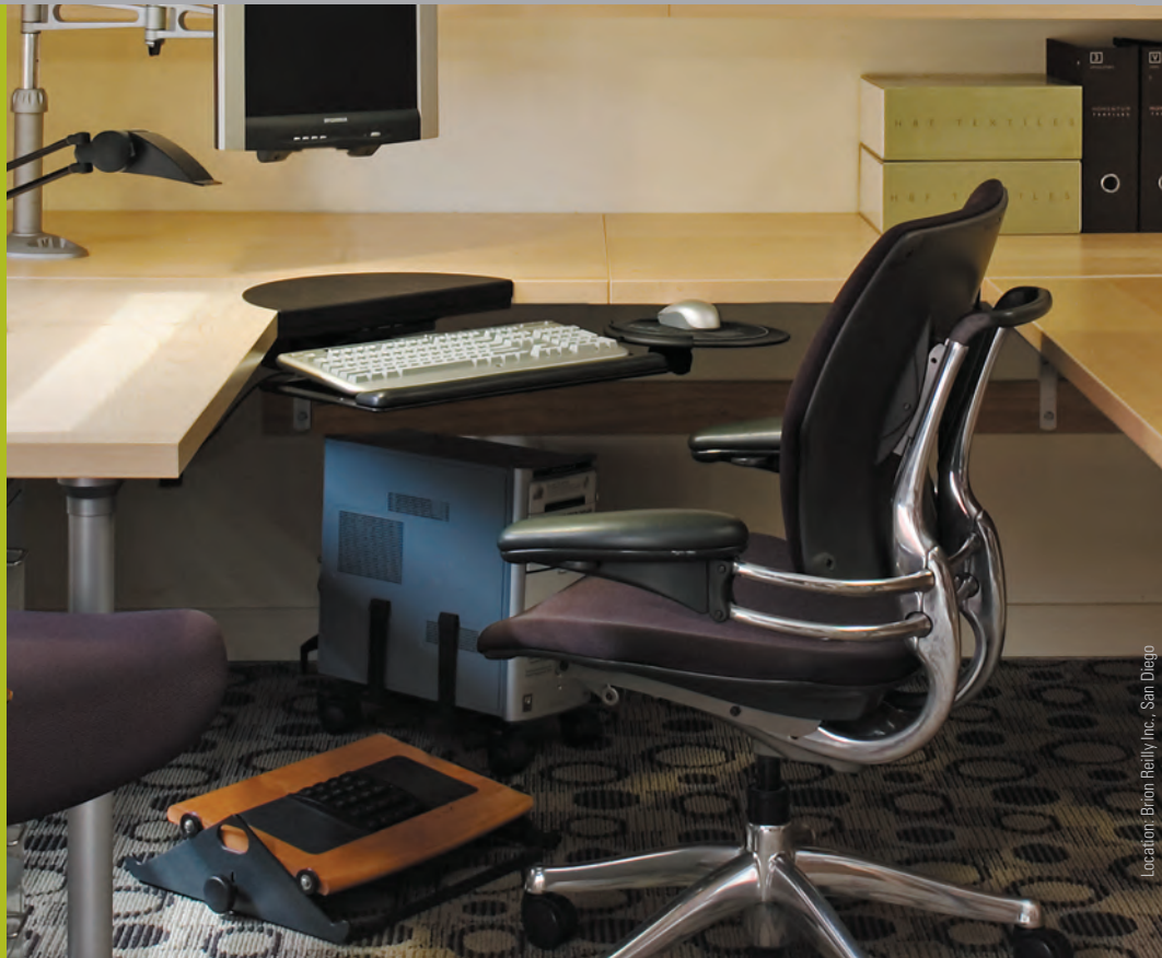
Location: Brian Reilly Inc., San Diego

A highly ergonomic work environment is built around four primary tools—task chair, articulating keyboard/mouse support, adjustable monitor arm and task light—that work together to improve the health and comfort of computer users. The absence of any one of these four tools may impact the ergonomic benefits of the others, whereas additional components, such as foot rests, can further improve the workstation's ergonomics. To better understand how the ergonomics leader can dramatically improve your workday with the right assessments, tools and training, contact your Humanscale representative.